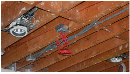
The red wire electrical box is for the smoke detector system. Notice the hole in the blocking through which the red wire passes which needs to be sealed.