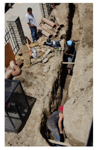
The plumbers digging the sewer pipe line ditch

At the weekly construction meeting on Friday morning, Alfredo Urbris, Vencor's construction supervisor, told the group that next week he would like to power wash the exterior of the building and then schedule the painting contractor. After the exterior painting is completed, the new windows will be installed.