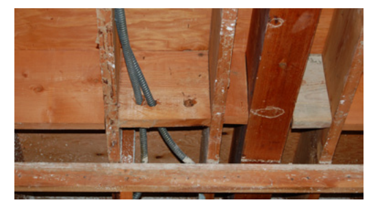
Electrical flex conduit needs fire caulking (red color) and the drilled hole in the blocking needs to be filled in.